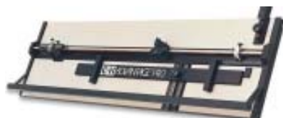
Logan Mat Cutting System